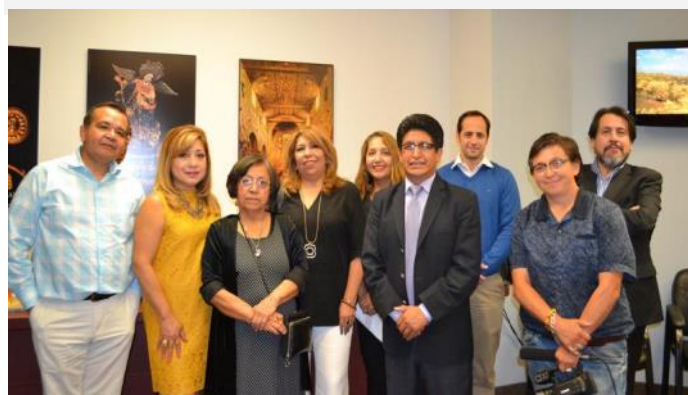
As part of the Toronto Latin American Film Festival (LATIFF), the Mexican film The Beginning of Time was presented at the Art Gallery of Ontario's Jackman Hall Theatre to a packed audience.

The LATIFF Festival was organized by the Hispanic Canadian Heritage Council in conjunction with the Consulates of Argentina, Colombia, Ecuador, El Salvador, Mexico and Spain, and with the support of prominent members of Latin American community and cultural associations in Toronto.