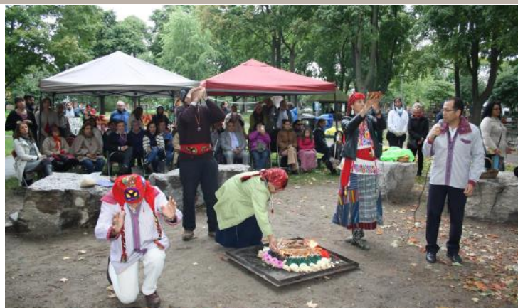
Hispanic Heritage Month was launched in Ontario under the auspices of the Hispanic Canadian Heritage Council (HCHC) with the traditional Mayan Sacred Fire ceremony depicted by the groups Waxaq'ib Q'ojoom and Jun Grupos Q'anil from Guatemala. The event was held at Dufferin Grove Park in Toronto.