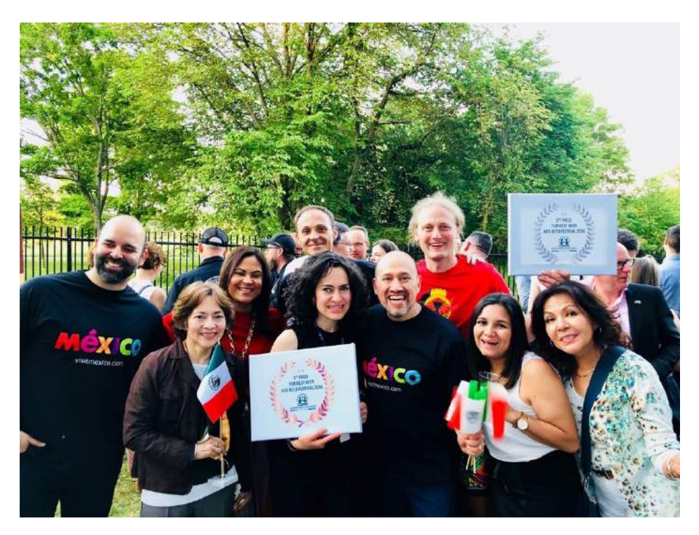
Staff from the Embassy of Mexico with Mexican citizens attending the event and representatives from the Embassy of Belgium in Stockholm holding their Festival awards.

During the event, very positive comments were received regarding the products from Cervecería María Bonita for the beer's perfect balance and softness on the palate, generating very good reviews and great enthusiasm among the attendees. This event also offered an opportunity to promote Mexico as a tourist destination, particularly the metropolitan areas and the Nayarit and Maya Rivieras.