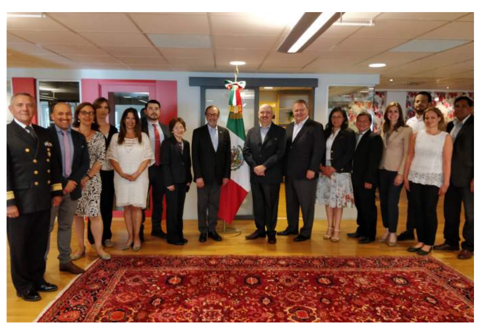
Deputy Minister of the Ministry of Foreign Affairs Carlos de Icaza and Director General for Europe Ambassador Francisco del Río visited the Embassy of Mexico in Sweden and took a photograph with Embassy diplomats and staff.

Deputy Minister de Icaza also held a courtesy meeting with the Swedish Parliament Speaker, Mr. Urban Ahlin, and with members of the Swedish Parliament's Foreign Affairs Commission.