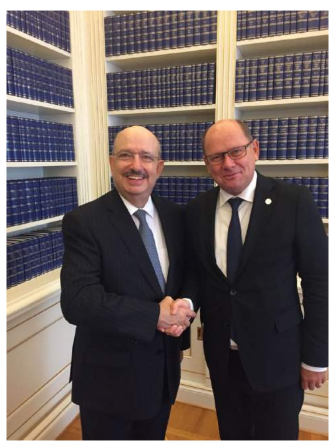
Deputy Minister de Icaza at the courtesy meeting with Swedish Parliament Speaker Urban Ahlin.