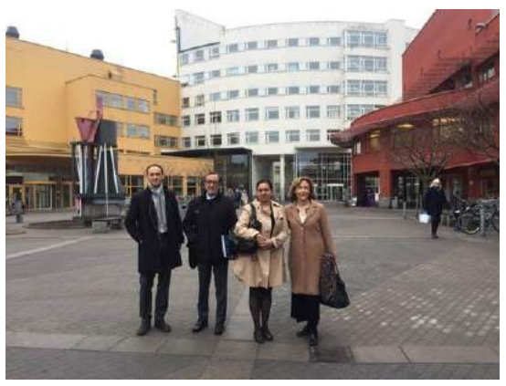
ProMéxico in front of the Jönköping Internatio-

Finally, the JU convened a conference in which approximately 50 people met the delegation, including Swedish students, Mexican citizens, and faculty members. On this occasion, the Ambassador The delegation from the Mexican Embassy and spoke about the economic and cultural power of Mexico, while nal Business School, or JIBS. those present had the opportunity to ask questions related to