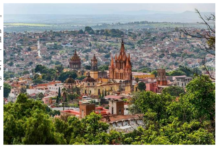
San Miguel de Allende, Travel + Leisure's number one city in the world for the second year in a row.