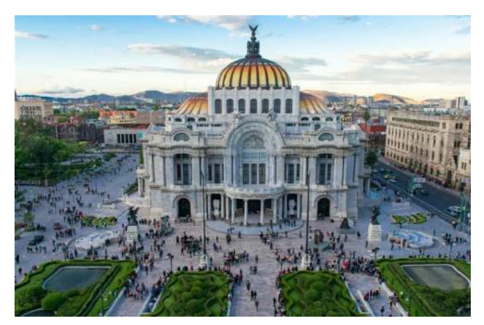
Mexico City, Travel + Leisure's 11th best city in the world.