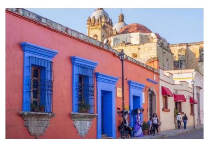
Oaxaca city, Travel + Leisure's second best city in the world.